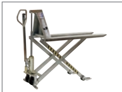
The trucks are made of stainless steel.