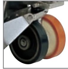
The trucks have at least one vulkollan anti-static wheel in order to conduct away static electricity.