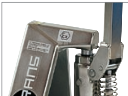
The explosion proof trucks are suitable for the pharmaceutical, oil, gas and paint industry.

Please ask for specification details. We also offer tailor-made solutions.