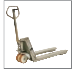
Strong construction ensures a long operating life and low maintenance costs.