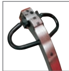
Possible to operate with the handle upright. Central location of all control buttons.