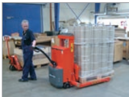
Optimum safety through transparent and impact-resistant safety screen and reduced driving speed in raised position.

*** Width between straddle legs of more than 1306 mm: Max. capacity 800 kg. Fork length of 1520 mm is not recommended.