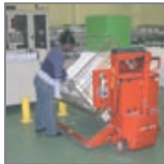
Available with side-tilting forks and/or optional extras, e.g. drum turner, remote control, level control, built-in charger.

Strong construction ensures a long operating life and low maintenance costs.