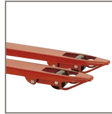
The hoop skates on the forks ensure an easy fork insertion and withdrawal in/out of pallets.