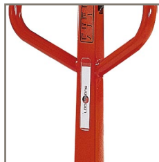
Can be marked with name/department.