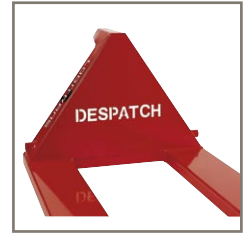
The company name or logo can be cut out in the triangle of the Panther.