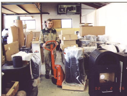
An easy handling of goods is ensured even in very confined spaces.