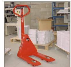
Panther is available with different fork lengths.

We also offer tailor-made solutions. Please ask for further information.