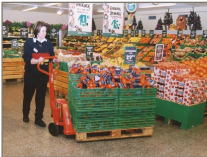
Adjustable fork height - no problems when handling low and worn pallets.

Stainless and explosion proof pallet trucks are also available.