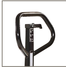
Ergonomic handle ensures the user a relaxed hold.