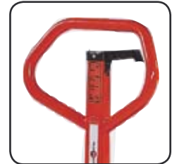
Ergonomic handle ensures the user a relaxed hold. The handle can be marked with the name/department.

Available with manual and electric lifting.