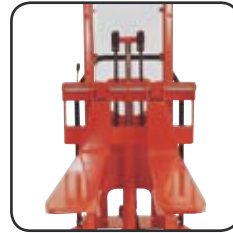
Adjustable forks are available in many different lengths and types.