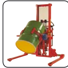
Available with side-tilting forks and/or optional extras, e.g. drum turner, remote control, level control, crane arm.