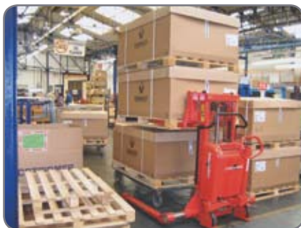
Strong construction ensures a long operating life and low maintenance costs.

***** Tests show that 1700 mm is enough - depends on width between straddle legs.